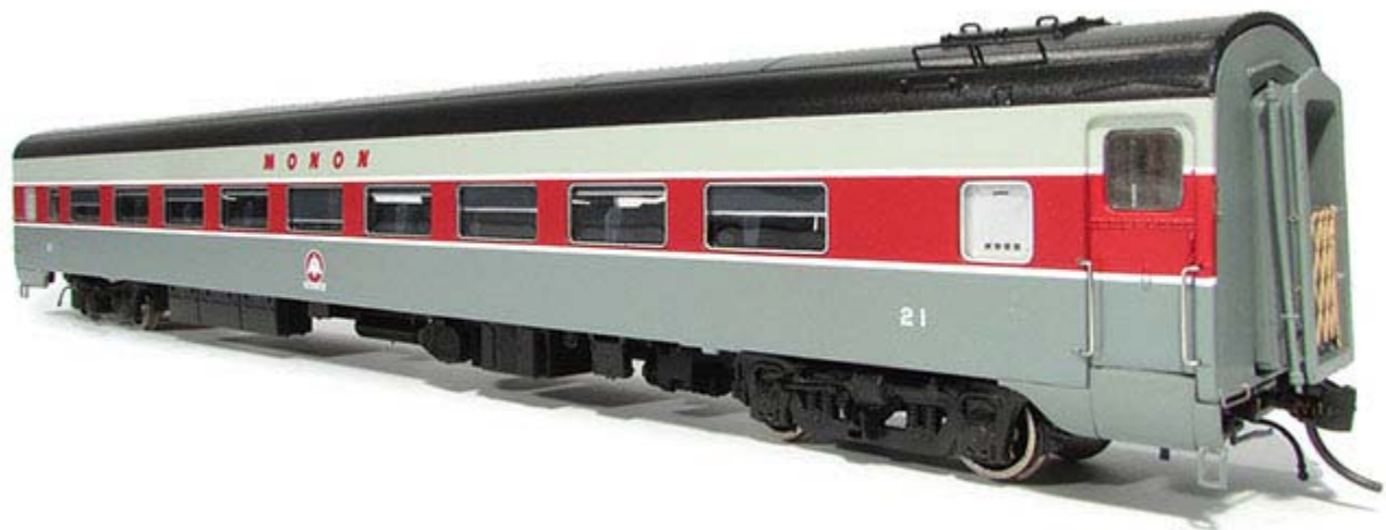
Super Continental Line Lightweight Coach - Monon

We're booked on the ScotRail sleeper back to London and we fly out on the 27th. So that's at least two hours in London on our last day! (I think I'm taking this "I'm from the North" thing a little too far.)