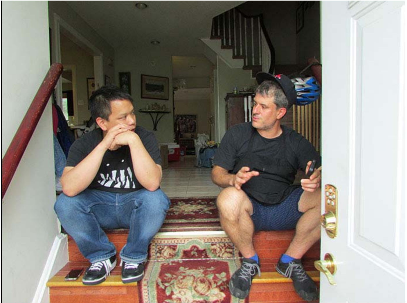
Two exhausted guys take a break from One Crazy Train...

Behind the scenes, Caroline Hollway was our boss. She organized everything and kept everything - and everyone - in line. There were as many as 20 or 25 people in my house at one time! And between shows there was a lot to set up and plenty of fires to put out (thankfully none in the kitchen). With no prior planning, the Heywood-Wakefield train seats in our living room became the mobile office. (The site office was the guest room in the basement - often with three people at a time, squished on the hide-a-bed, using their mobiles and laptops simultaneously!)