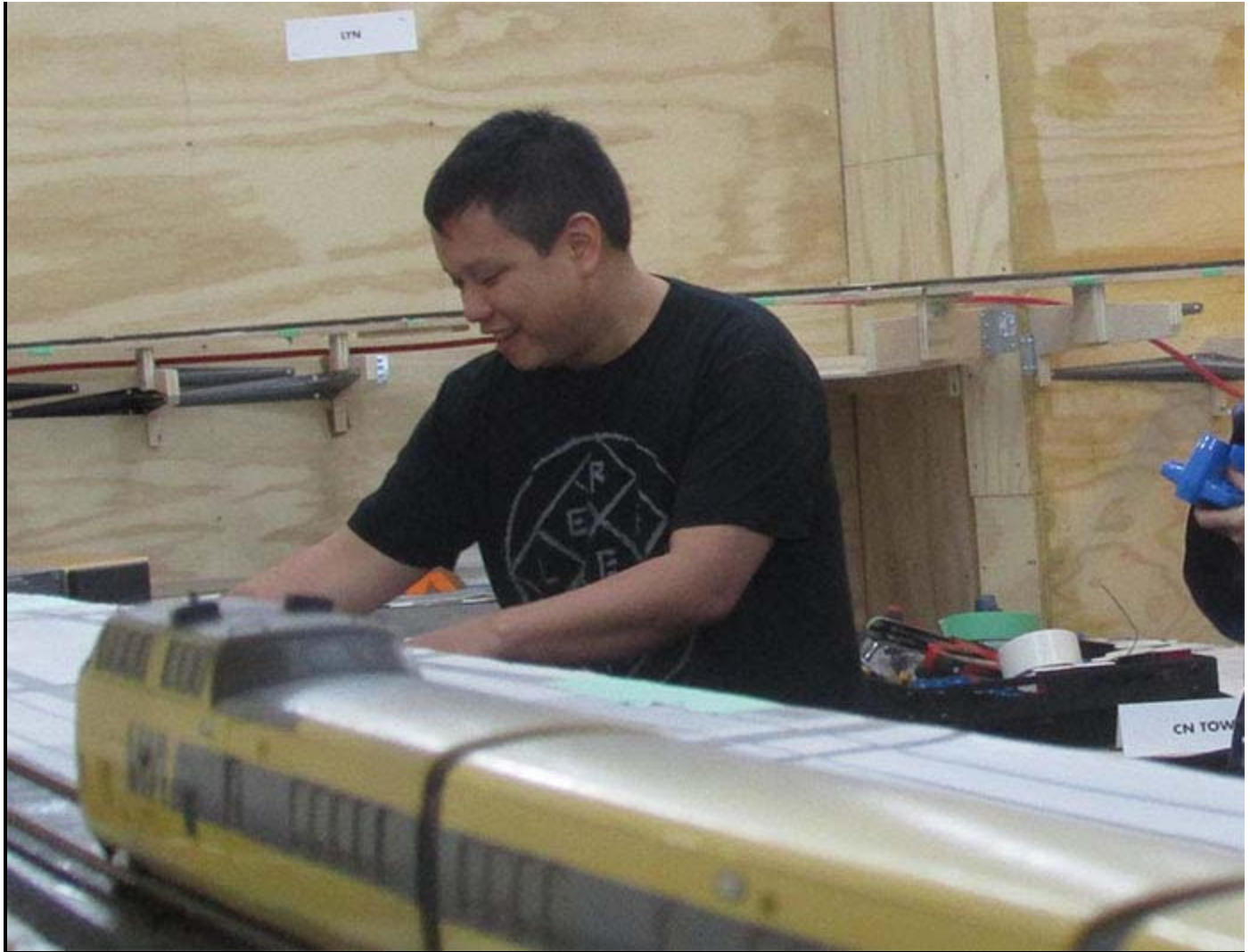
Kid Koala scratches the blues while first-class Turbo passengers watch from the dome.

Kid Koala is a scratch DJ (or "turntablist" in hoity-toity circles). He's performed at venues all over the world including Madison Square Garden and the Glastonbury Festival, where he's headed in a few days. I was floored by the captivating music he can create simply by modifying sounds on turntables.