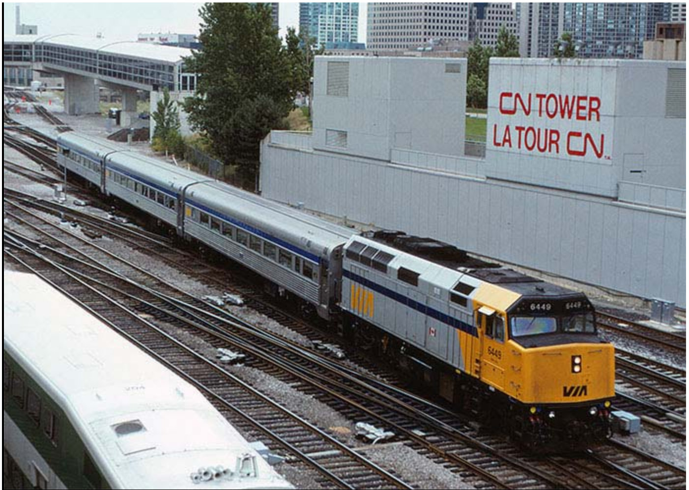
Three ex-CP Budd coaches on a Toronto-Niagara Falls train in 1992.

The Canadian regularly has two or three of these coaches per train and The Ocean - when using Budd equipment - could have as many as six or seven at busy times.