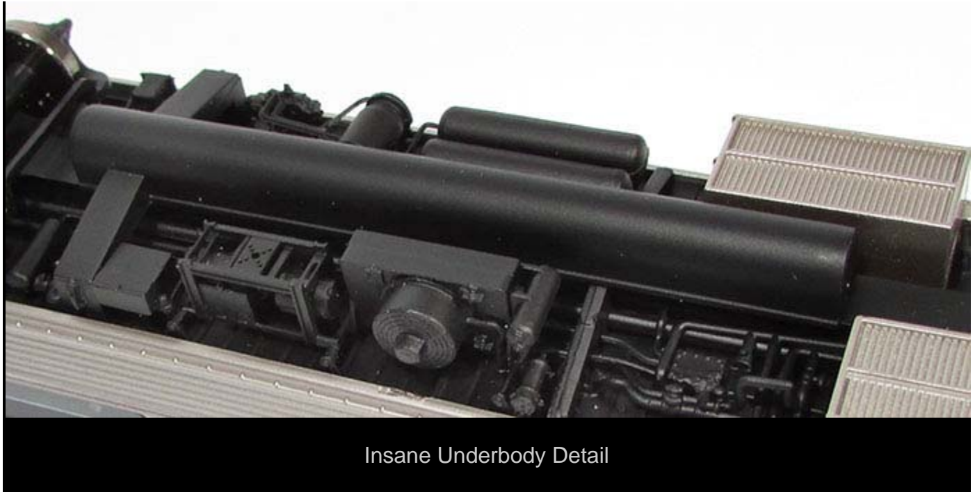
Insane Underbody Detail

The coaches are arriving in July, as in NEXT MONTH! They are already en route. VIA has only ordered a few dozen of each road number so make sure you get your order in early. VIA's production runs of the Park Car, Skyline, Chateau Sleeper and Dining Car have all sold out so make sure you stock up on coaches.