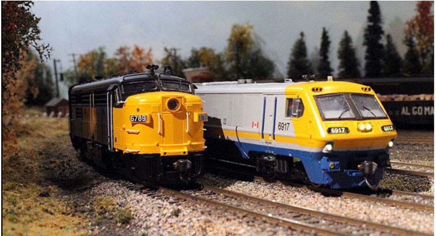
FPA-4 6789 and a Friend on the Vermont & Essex Layout

Because we've just launched this (humbly) amazing video showcasing the FPA-4 and FPB-4 sounds ( click here to watch it!), we're giving you an extra couple of weeks to order yours before we start production. So please order your FPA-4 and FPB-4 by the end of June. Click here for info.