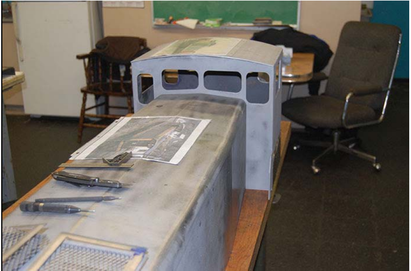
Somehow I think that our decoders won't have enough power for Graham Wood's incredible scratchbuilt 1/8 scale GMD-1. Pity!

The MSRP is $109.95 for the decoder and speaker. If you want the decoder on its own... throw away the speaker. You can order these from your dealer or direct from us. More info can be found here .