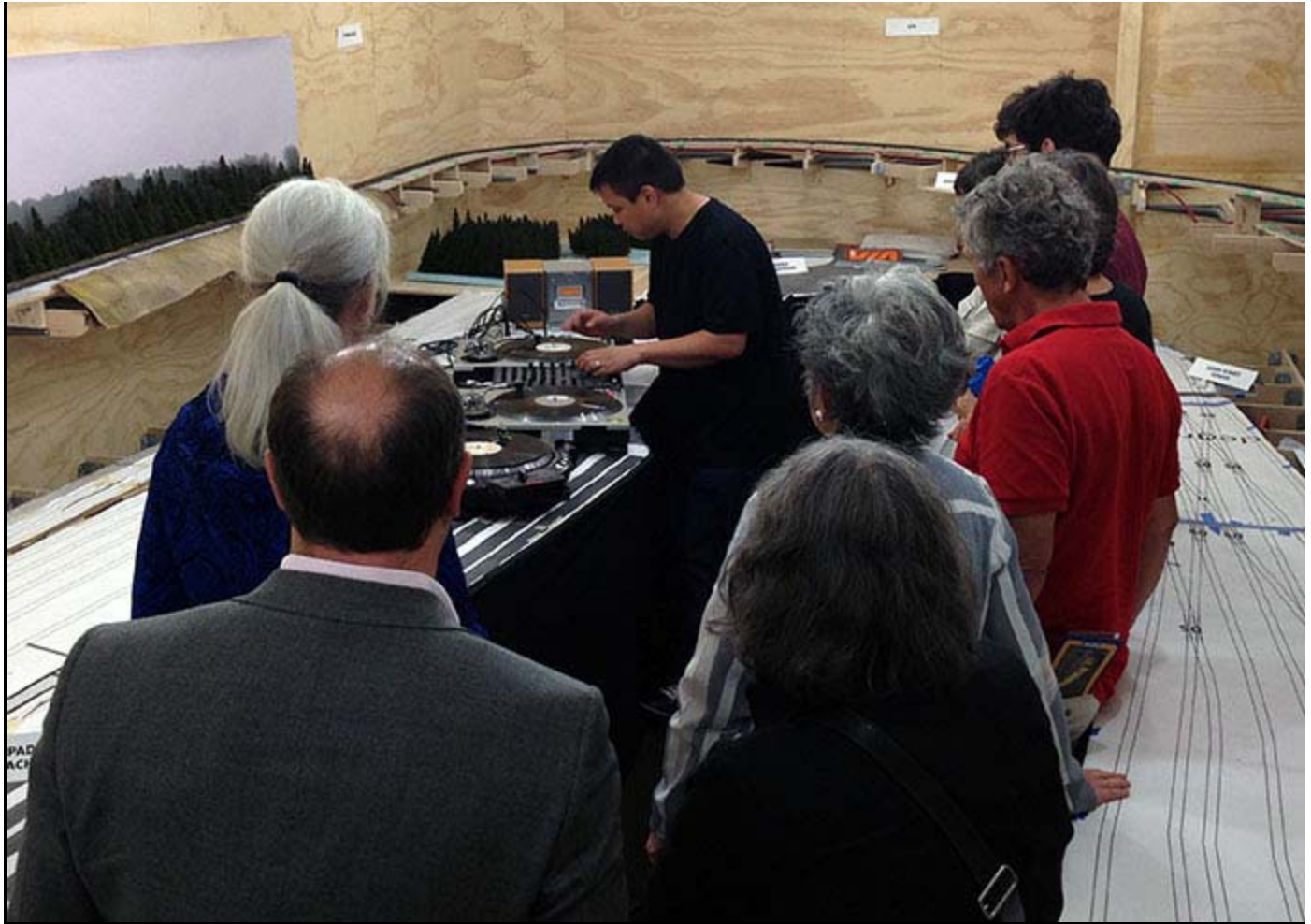
Spinning discs for The Lost Train