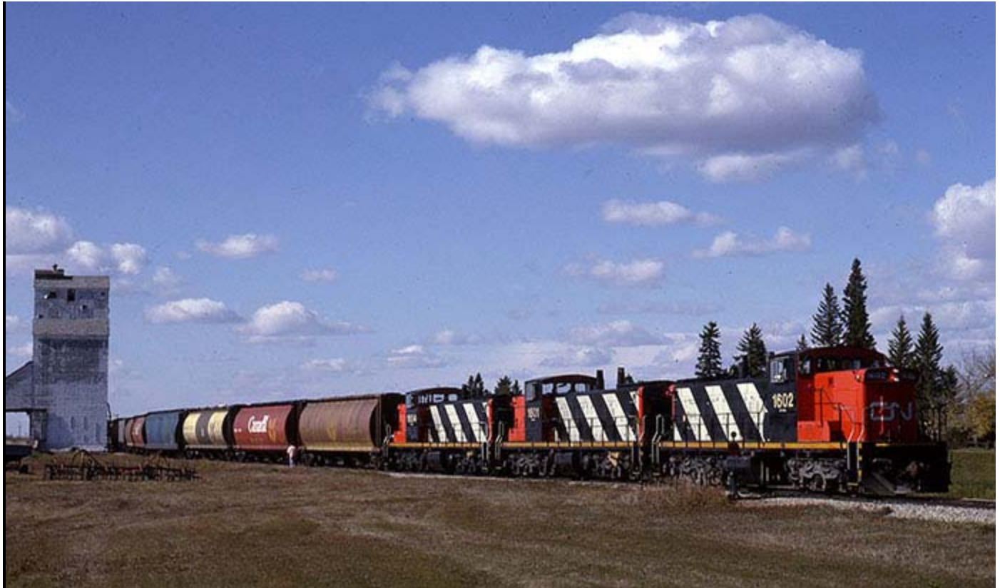
A trio of GMD-1A locomotives brightens up the Prairies.