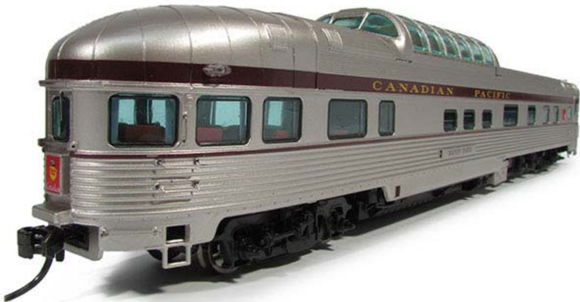
Budd Park Car