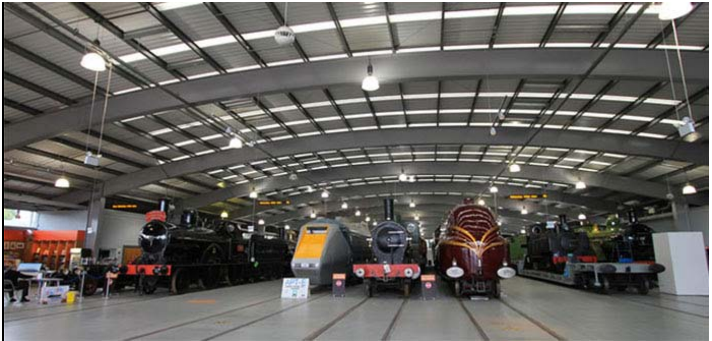
Just a smattering of Locomotion's extensive collection...

We love travelling by train in the UK and I am sure that you do as well. I hope you will take a day off work and train down (or up, if you are way north) to Shildon and spend an enjoyable time with us. It will be an intimate party atmosphere, and a lot of the British model railway press personalities will be in attendance so you can meet and talk to them too!