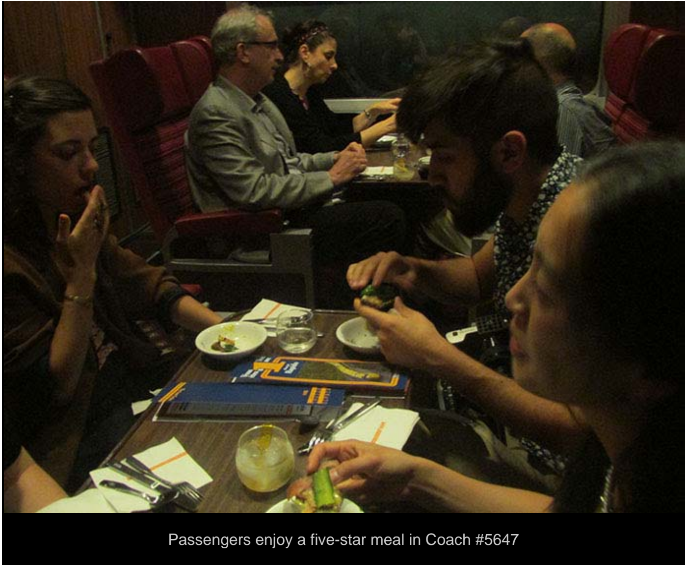
Passengers enjoy a five-star meal in Coach #5647

While passengers were eating their meals and getting to know each other in the rather cozy (knees-knocking) atmosphere of the coach, Kid Koala jockeyed train-themed music from a pair of turntables set up in the luggage rack. In the background you could still hear the sounds of the train that I always pump through hidden speakers. Servers in 1980s VIA-inspired uniforms kept the passengers well fed and well imbibed.