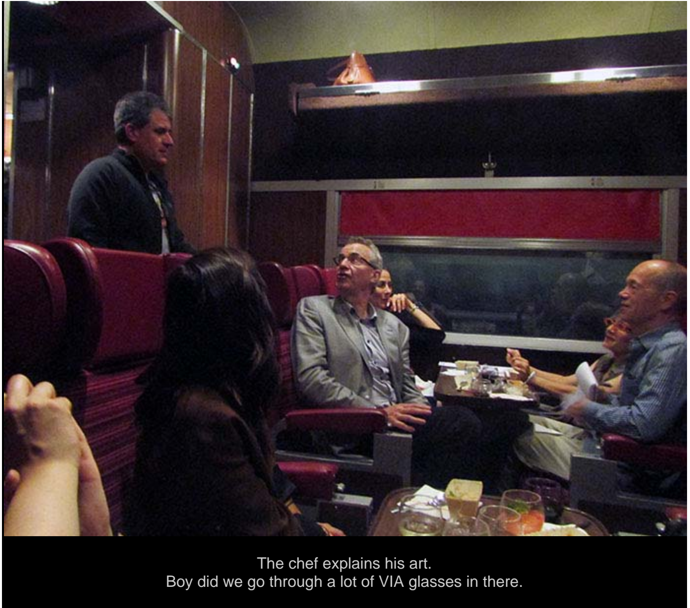
The chef explains his art. Boy did we go through a lot of VIA glasses in there.

After their meal, the passengers were led down the hall to the other part of my basement - namely the HO scale Kingston Subdivision . Here I revealed that they were, in fact, inside my house in suburbia. The reactions were amazing! Most people had thought we were in a museum or a rented theatre space. Several people assumed we were in a VIA or CN office building! Here I took them through the process of resurrecting coach 5647 by showing them slides in their very own souvenir Viewmasters!