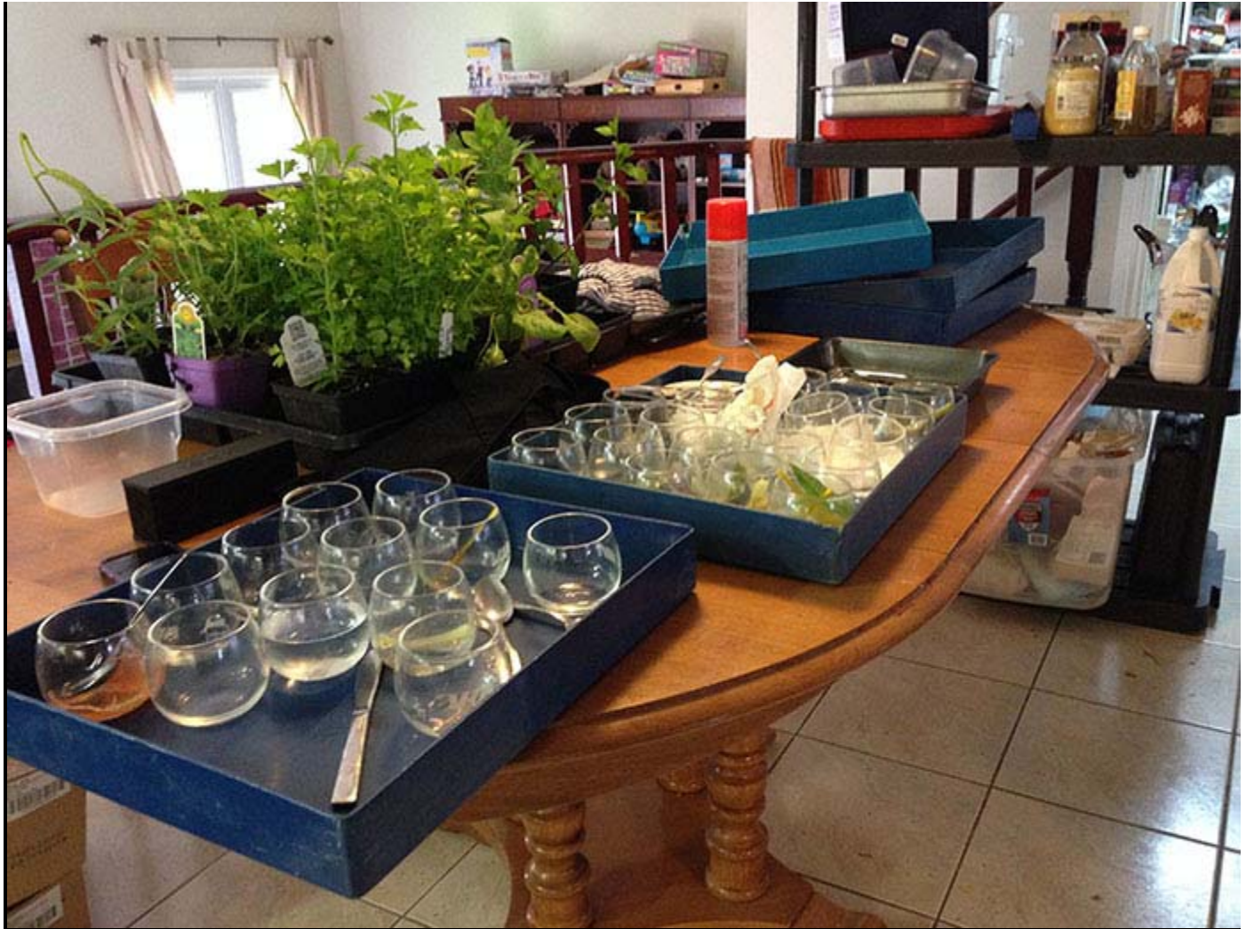
Old VIA and CN trays do what they were designed to do for the first time in over 20 years!