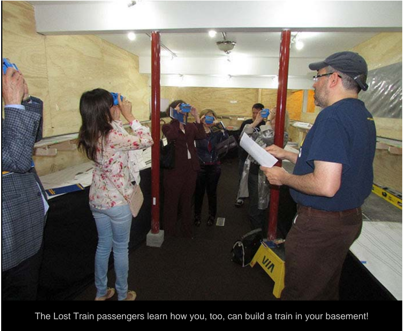
The Lost Train passengers learn how you, too, can build a train in your basement!