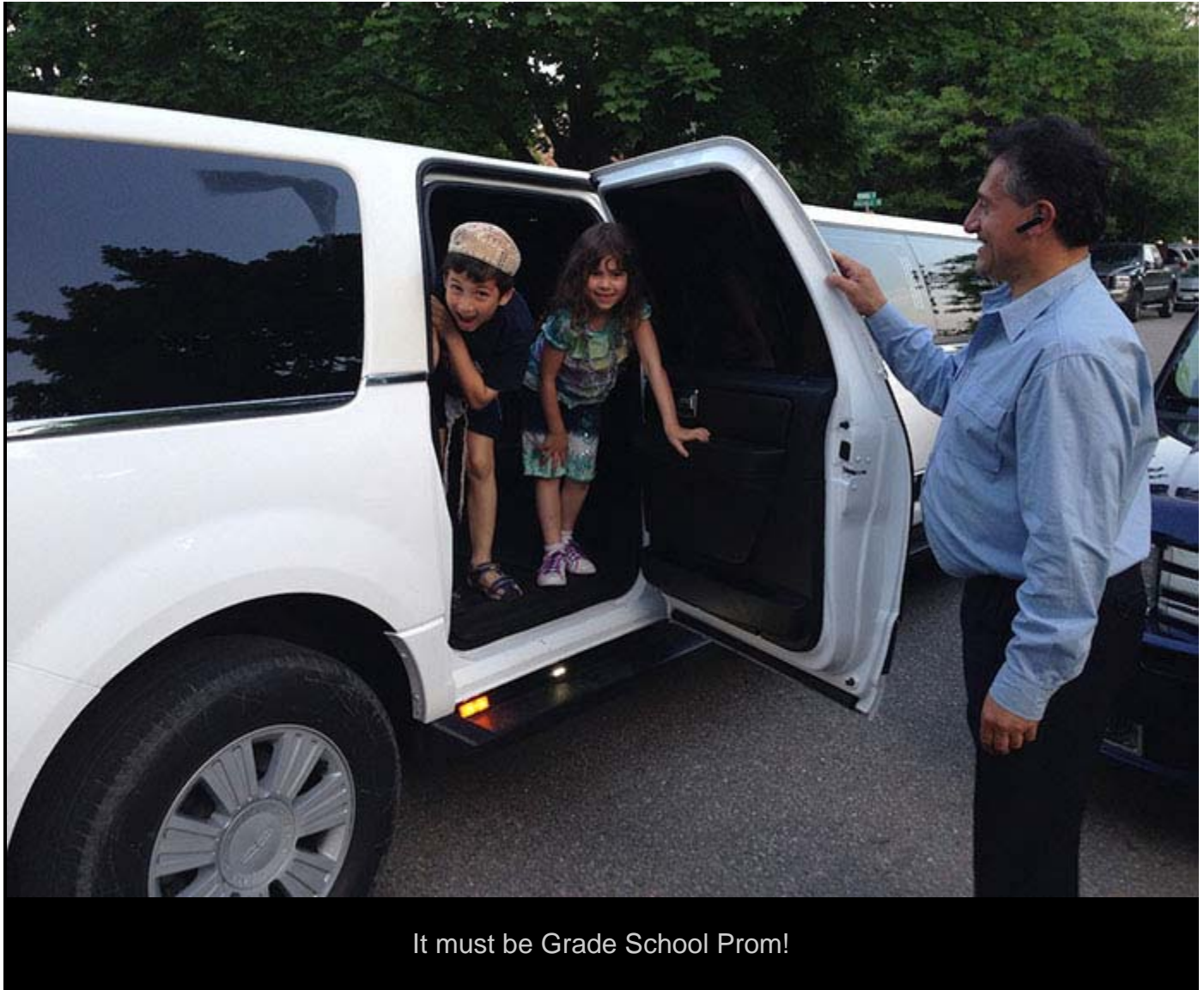
It must be Grade School Prom!

The most important thing is that everyone had fun, from the three creative forces behind the project to the staff and most especially to the passengers. For the passengers, each journey was a time of relaxation, surprise and delight, and I hope that the 100-odd people who rode The Lost Train will keep the memories close, especially when planning their next journey... Maybe they'll choose the train!